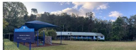
Orama Public School 2024

A reminder to please refrain from providing or allowing your students to bring lollies, soft drinks or other foods with a high sugar content to school. It is important for students not to share their food with others, as we are mindful of parents' dietary preferences and allergies/ intolerances amongst our school community. Thank you for your understanding.