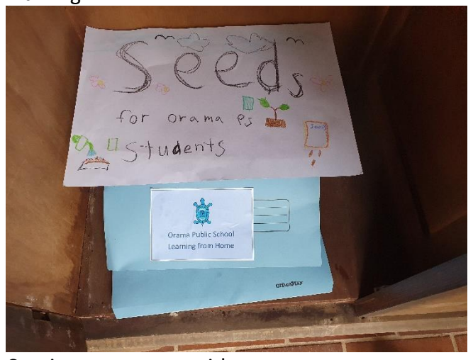
Continue to engage with <a href="https://education.nsw.gov.au/teaching-and-learning/curriculum/learning-from-home">https://education.nsw.gov.au/teaching-and-learning/curriculum/learning-from-home</a> where regular updates are also placed.

placed there every Monday afternoon. At the end of each week if you can return the booklets for marking.