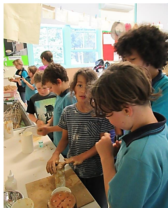
A hive of activity creating the bee units